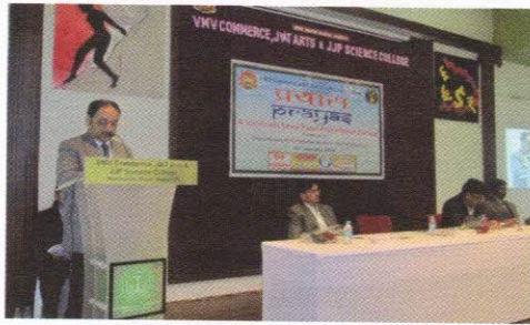
Prayas-A University Level Paper Presentation Contest