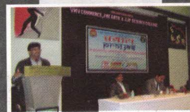
Prayas A University Level Paper Presentation Contest

In the present scenario, the focus is on use of computer in each and every field. The fields may be Manufacturing, Maintenance, Equipment, and Development of new Techniques, Improvement of Technology, Education, Governance, Research, Trade and commerce etc. For using computer, a well-informed well-trained manpower is required. Master in Computer Application is a course, which provides trained manpower to such industries.