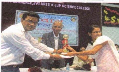
Felicitating Prayas Winner